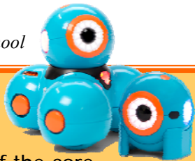
★Laird Penny Nauset Regional Middle, Cape Cod, MA

Computer Science is now part of the core curriculum, and we launched after school Coding Club for all students. Children write code for the Dash and Dot robots to solve challenges — learning and having fun in the process!